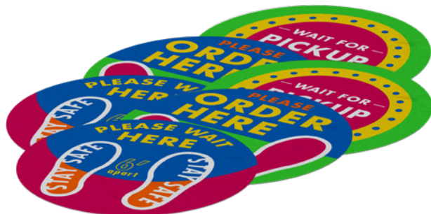
18" Circle (Set of 6)