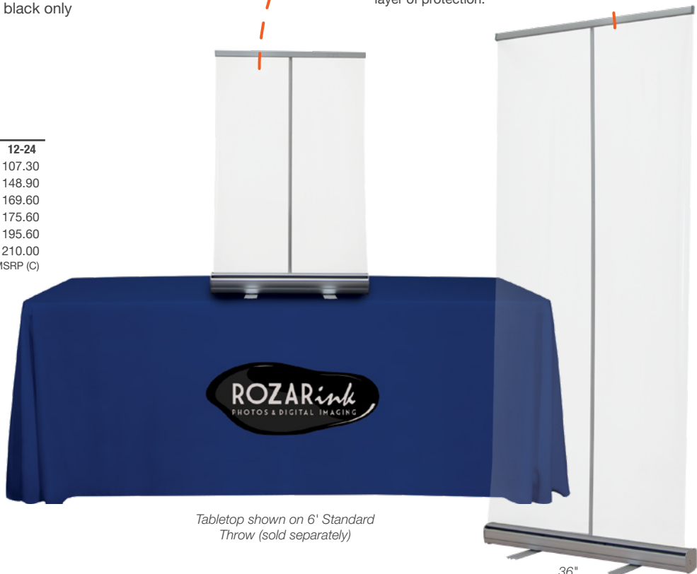
Tabletop shown on 6' Standard Throw (sold separately)

Production Lead Time: 2 days from final proof approval