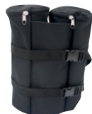
Tent Sandbag Ballast

View current assembly videos and instructions on our website.