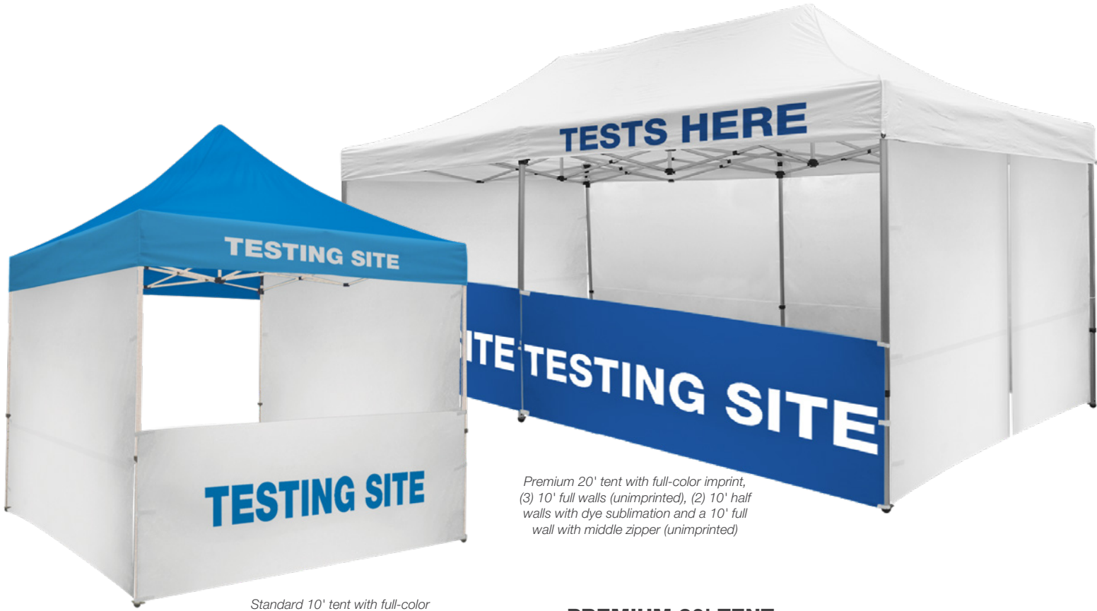
Standard 10' tent with full-color imprint, (2) 10' full walls (unimprinted) and 10' half wall with full-color imprint