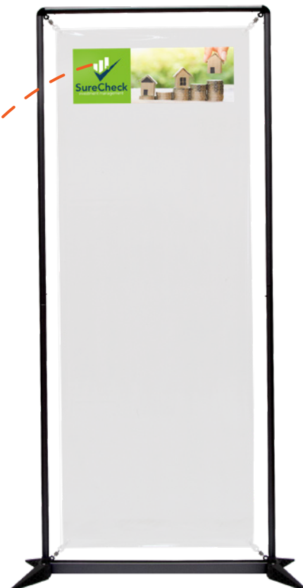
3.5' with Imprinted Cling

Easily apply imprinted window cling anywhere on the clear vinyl.