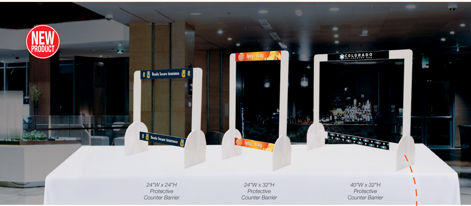
24"W x 24"H Protective Counter Barrier