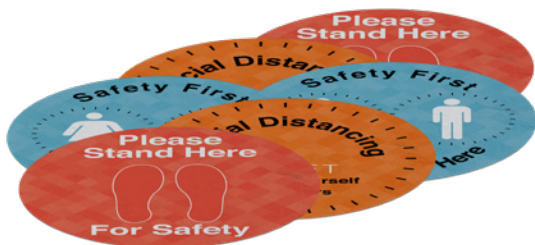
12" Circle (Set of 6)